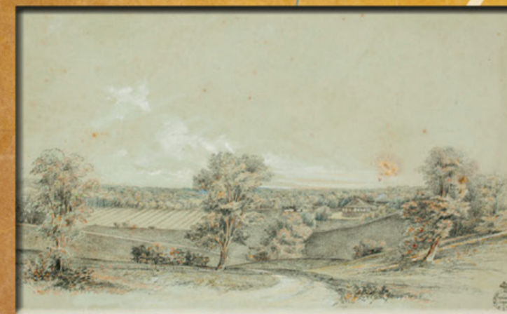
Above: Demondrille: from "Sketches of Yass and Murrumburrah District 185- / Mrs J. Milbourne. Reproduced courtesy Dixon Galleries, State Library of NSW - DG SV1B15. Digital no: a6085003

Below: A view of the Demondrille property showing the landscapes of the Murrumburrah / Lambing Flat region at the time of the riots.